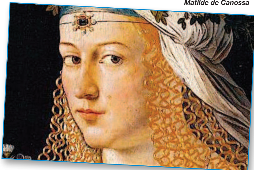
Matilde de Canossa

In contrast to what some historians refer to, not all female convents were subjected to male cloisters but, even, the opposite can be seen. Roberto de Abrissel, in Fontevrault, in the first years of the 12th century "decided that the monks of his order were under the government of the abbess of the former feminine convent." If on the one hand, some abbesses could have more power than the abbots could, on the other the married women, of any social category, were independent of their husbands also concerning the economic rights. "In the acts above it is usual to find cases of women married who work on their own, for example, starting a business or commerce, without being obliged to present an authorization from her husband". Also among the peasants, among the so-called "servitude", there were women who bought or sold small properties. In the act of the eleventh century there is talk of