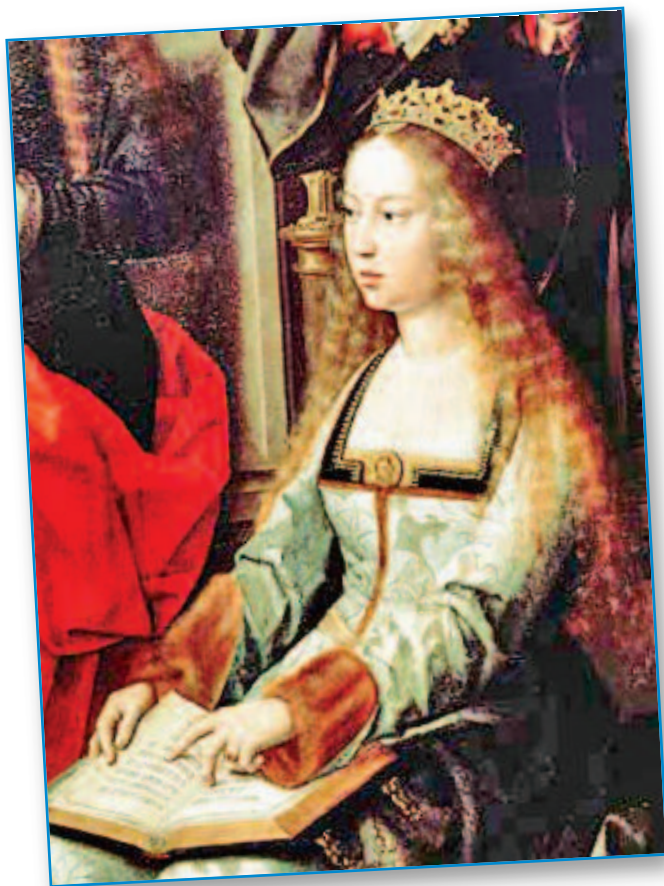
Isabel de Castilla

while the absence, illness or death of the king; they had their chancery, their independent field of activity. "Do not forget, also, that it was a queen, Isabel de Castilla , who sponsored that company that became the symbol of the beginning of the modern era, the arrival of the Spaniards to America with the crossing of Christopher Columbus.