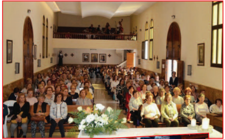
Photo are a manifestation in themselves, which means the "Salesian joy" reunion.